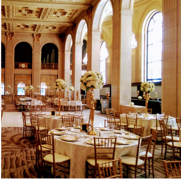
A Classical Romantic theme · 2016