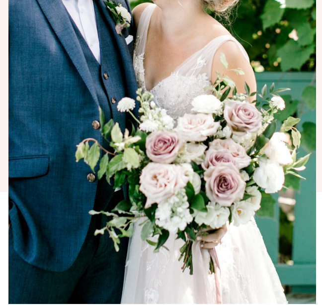
Garden-style bridal bouquet · 2019